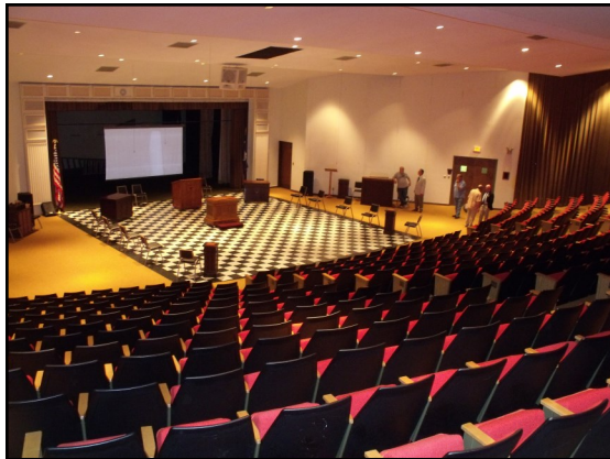
Ancient & Accepted Scottish Rite Temple