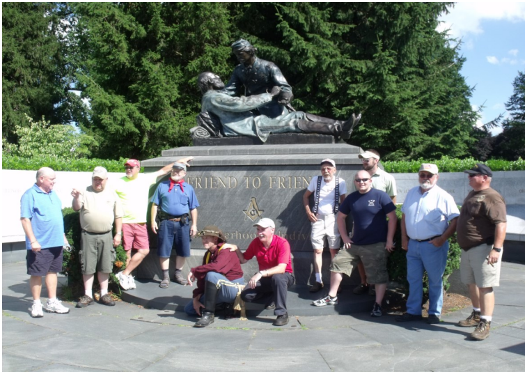
Friend to Friend Monument Gettysburg

A really enthusiastic work party completed all the tasks planned during the summer months. The main focus was on the property frontage, after the break in the Police advised that the trees and bushes in front of the Hall should be cut away to give a clear view of the building from the front door. This proved to be quite an undertaking and eventually two skip loads of growth were taken away. The gardens were tidied up and suggestions were made to make the frontage more low maintenance. These ideas will be discussed and if feasible put in place next year. The damage caused to the internal doors from the break in required that they were repainted and this was also carried out. New down lights were installed in the Lounge and the bar was completely cleaned including the ice making machine. Contract Roofers carried out the Annual inspection of the roof and repairs were carried out. Contract Floor refurbishers also gave the Main Hall floor its first polish since major works were undertaken last year. It is important that these inspections and the necessary action taken to keep the premises in good condition be carried out annually to keep on top of any repairs due.