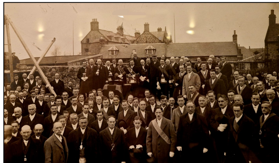
Lodge St. John Operative No. 37 Laying of the Foundation Stone of the Masonic Hall 1926

The oldest minute dates from 28th. December 1726 and the early minutes of this Operative Lodge are usually very brief, but they do contain some interesting facts. The Lodge traces its origin from 1706, although some early minutes are lost some detail the operative works that members of the Lodge undertook in the surrounding area. Maybe wisely, there is no mention in the early minutes of the troubled times of 1715 and 1745 and the Lodge has survived these years, and survives to this day. The most interesting minute concerns the Lodge applying to the Grand Lodge of Scotland (which was formed in 1736) for a Charter. This Charter was granted on 7th. February 1739.