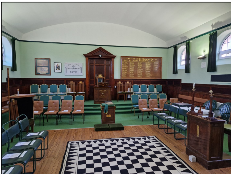
The beautiful interior of the Masonic Hall, Forres.