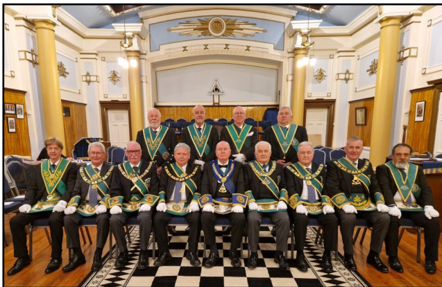
Above 579 Office- bearers 2025-26 Left Central South Africa Deputation.