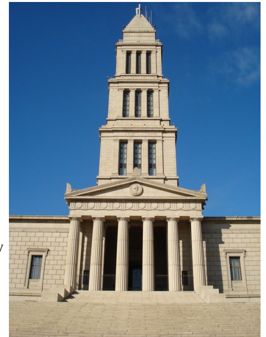
George Washington Masonic Memorial